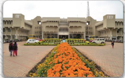
SDM College of Dental Sciences & Hospital