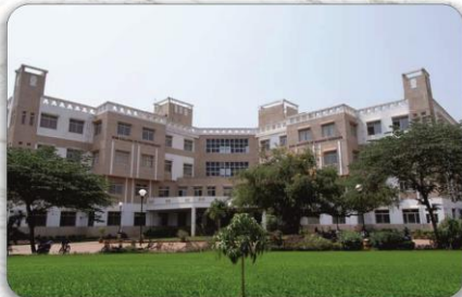
SDM College of Physiotherapy & SDM Institute of Nursing Sciences