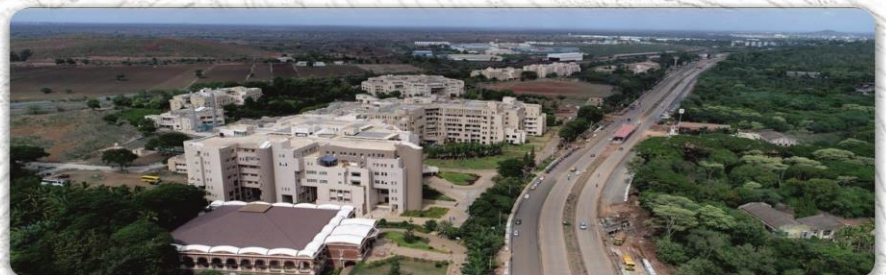
Panoramic View of Campus