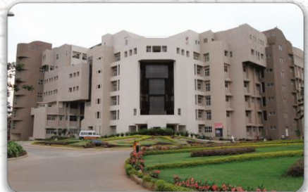
Shri Dharmasthala Manjunatheshwara University