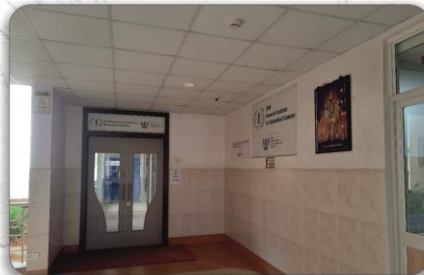
SDM Research Institute for Biomedical Sciences