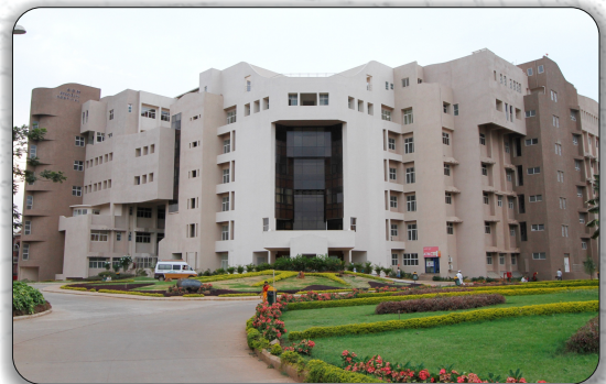
Shri Dharmasthala Manjunatheshwara University