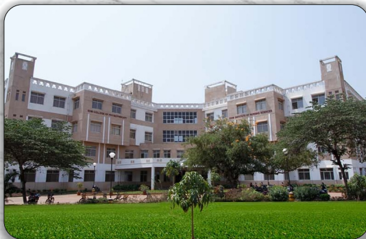
SDM College of Physiotherapy & SDM Institute of Nursing Sciences