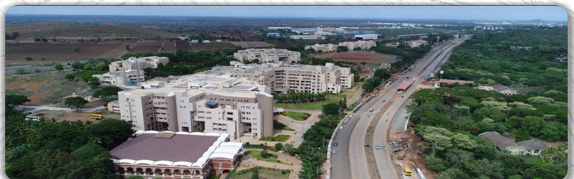
Panoramic View of Campus