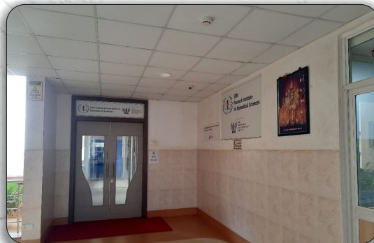
SDM Research Institute for Biomedical Sciences