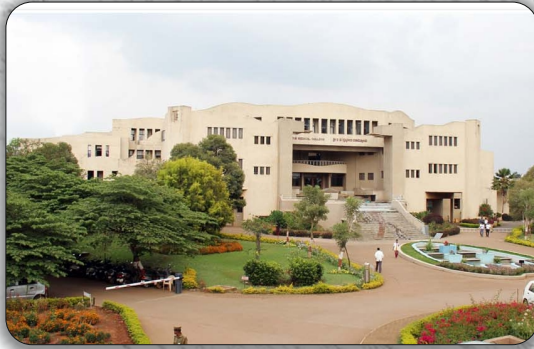
SDM College of Medical Sciences & Hospital