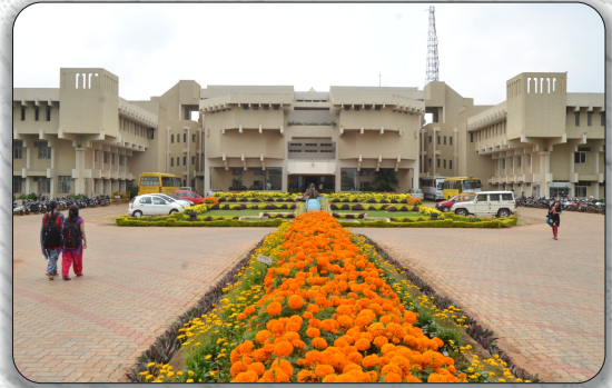
SDM College of Dental Sciences & Hospital