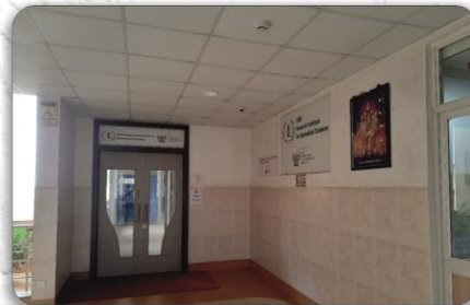
SDM Research Institute for Biomedical Sciences