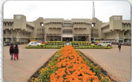
SDM College of Dental Sciences & Hospital