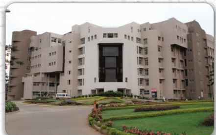
Shri Dharmasthala Manjunatheshwara University