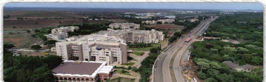
Panoramic View of Campus