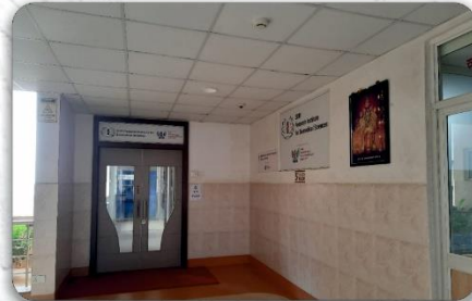
SDM Research Institute for Biomedical Sciences