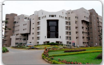
Shri Dharmasthala Manjunatheshwara University