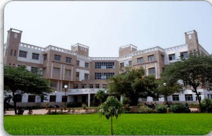
SDM College of Physiotherapy & SDM Institute of Nursing Sciences