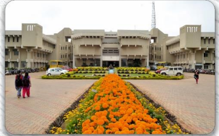
SDM College of Dental Sciences & Hospital