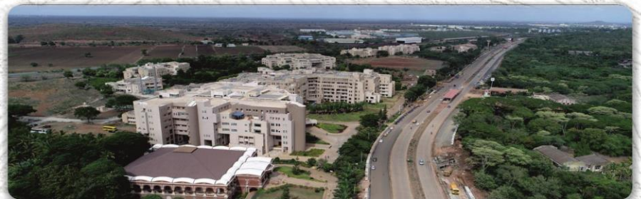
Panoramic View of Campus