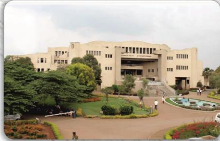
SDM College of Medical Sciences & Hospital