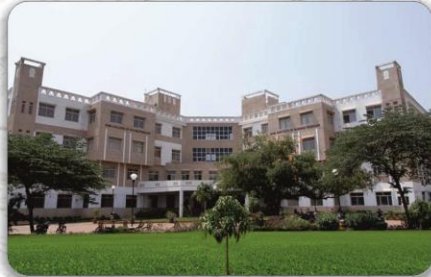
SDM College of Physiotherapy & SDM Institute of Nursing Sciences