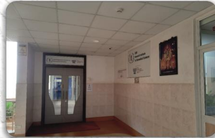
SDM Research Institute for Biomedical Sciences