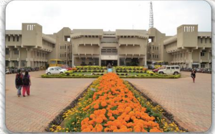
SDM College of Dental Sciences & Hospital