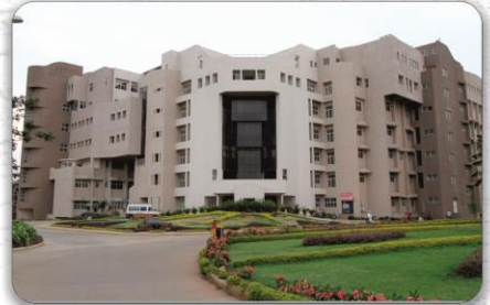
Shri Dharmasthala Manjunatheshwara University