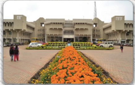
SDM College of Dental Sciences & Hospital