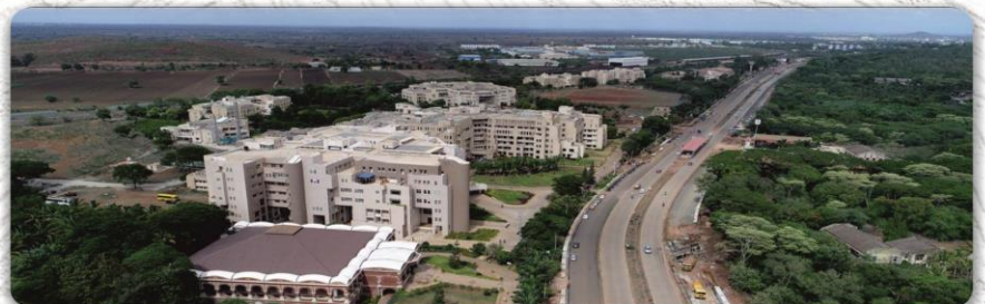
Panoramic View of Campus