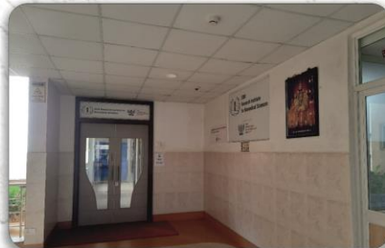
SDM Research Institute for Biomedical Sciences