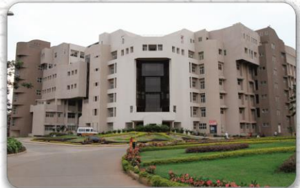
Shri Dharmasthala Manjunatheshwara University