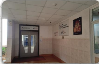
SDM Research Institute for Biomedical Sciences