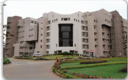
Shri Dharmasthala Manjunatheshwara University