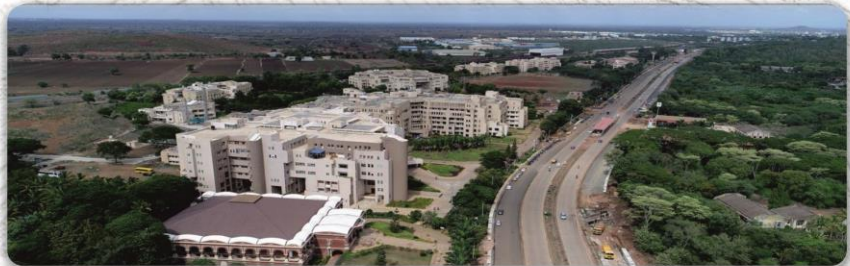
Panoramic View of Campus