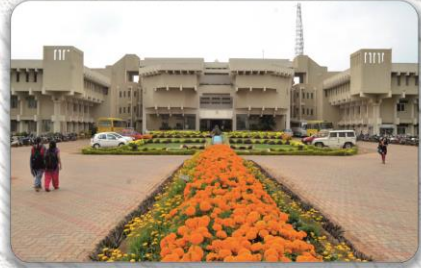
SDM College of Dental Sciences & Hospital